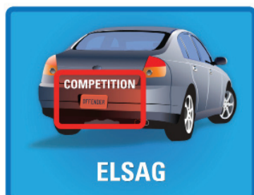
ELSAG Sweet Spot Competition Sweet Spot